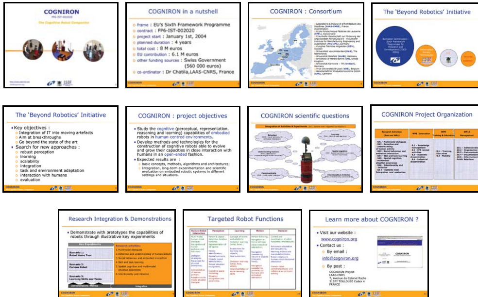
Figure 1: One recent version of the COGNIRON project presentation