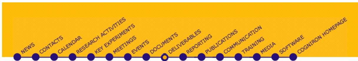
Figure 1: Navigation area of the internal COGNIRON webpages (restricted access)

For instance, the navigation area of the website is following these three key elements : the blue/yellow opposition and the use of the Verdana font.