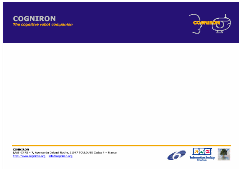
Figure 4: Example of landscape template (to be used for the press kit)