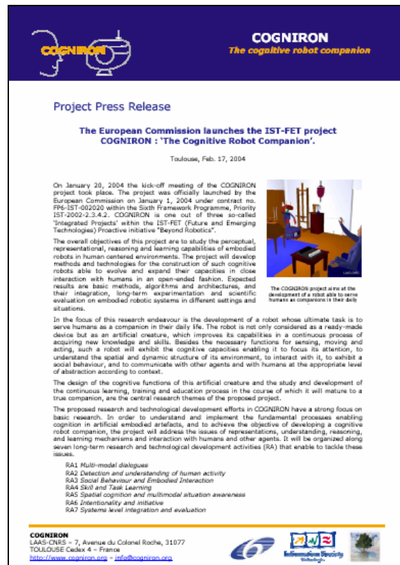
Figure 3: Example of press release : project launch

Again to ensure that an homogeneous image was conveyed by the project documents, such as press releases, newsletters, a template has been prepared, both in portrait –e.g. used for press releases, and landscape format –e.g. used for the project press kit (see deliverable D.10.5.3).