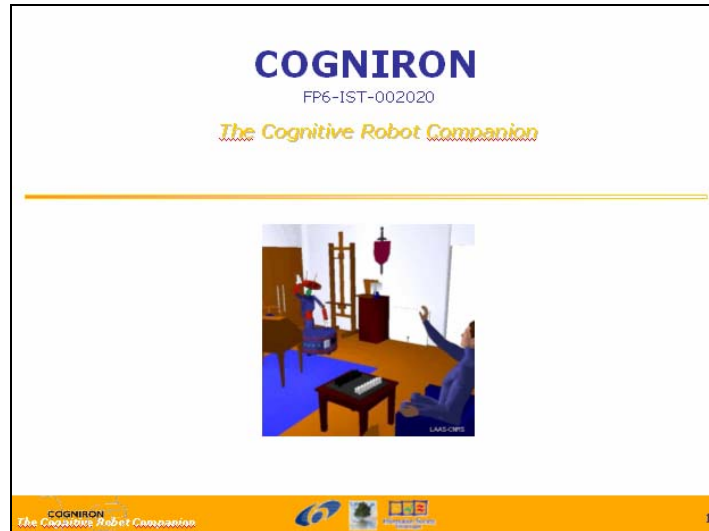
Figure 2: Overview of the template for project presentations